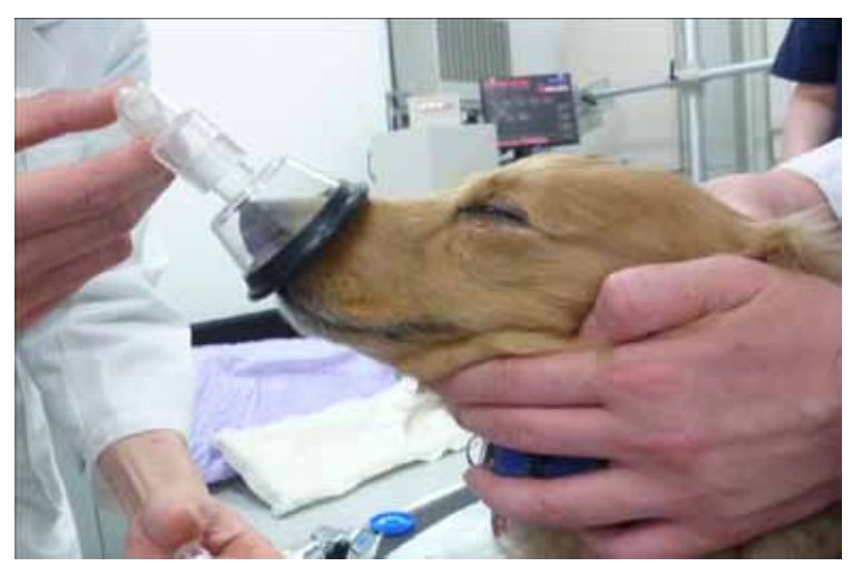
Figure 1. Preoxygenation and denitrogenation using percussive ventilation (PV). Pulsed-pure oxygen from a percussion ventilator was administered through the external nares by using a small anesthesia mask.

breathing itself can result in preoxygenation (Ginimuge et al, 2009). In veterinary medicine, some authors have recommended preoxygenation before induction in some situations, such as for animals with pulmonary lesions (Pascoe and Bennett, 1999). To the best of our knowledge, only one report by McNally et al. (2009) described the efficacy of 3 minutes of preoxygenation with respect to time to desaturation. However, this method is time-consuming and cannot be performed in dogs because of face mask refusal.