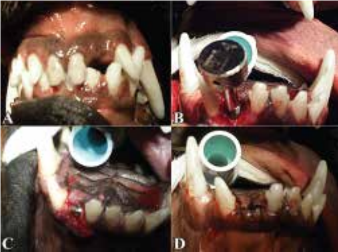
Figure 1. Surgical procedure: (A) lack of tooth #202 with normal appearance of oral cavity mucosa, (B) placement of implant into implant bed, (C) implant with healing cap, (D) surgical wound after suturing.

be aware of possible complications that can impact the lifespan of the implant. Considering that very hard food can damage the implant and the future prosthetic restoration, the dog's diet needs to be adjusted to the new situation.